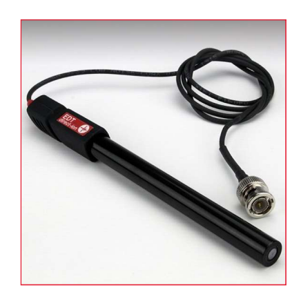
Sulphide Half Cell ISE