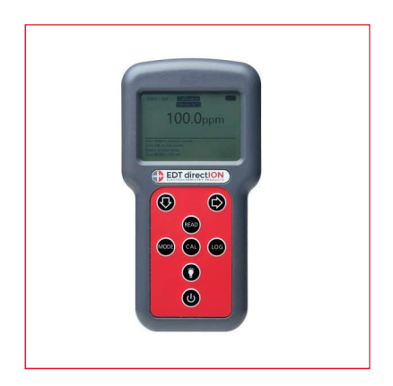
QP459 Portable Ion Meter