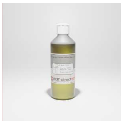
pH 7 Buffer Solution (500ml)