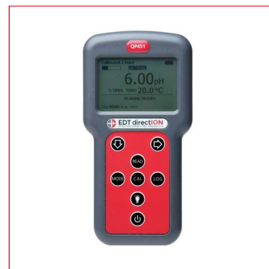
QP451 Portable pH Meter