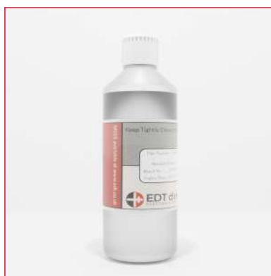
EDT Standard Solutions