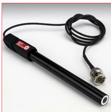
EDT Combination ISEs