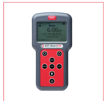
QP451 Portable pH Meter

www.edt.co.uk/product-category/ph-testing/ph-buffer-solutions