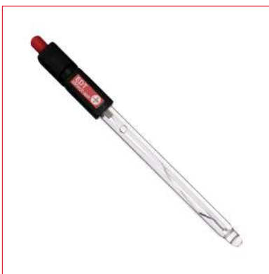
Glass pH Combination Electrode