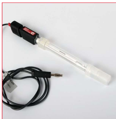
Double Junction Reference Electrode