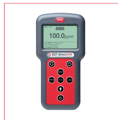
QP459 Portable Ion Meter

www.edt.co.uk/product-category/ion-selective-electrodes/ise-standards