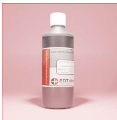
Ionic Strength Adjustment Buffers